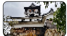
"Precinct of the Shinpuku Temple, Arimatsu tie-dyeing and Inuyama Castle"

真福寺紹介： 参考 URL https://www.shinpukuji.com/